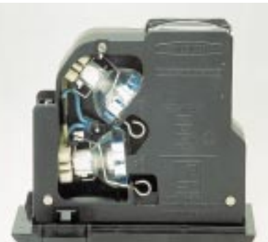
KODAK Extra Bright Lamp Module