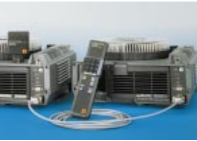
KODAK EKTAPRO MASTER/SLAVE Dissolve